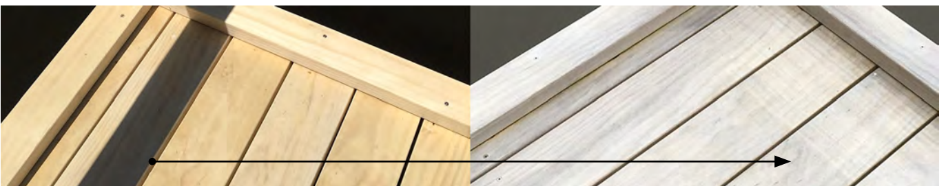
Natural greying of Accoya decking over time

Additionally, surface mould development can be reduced by applying a solution that has effective levels of performance protection, helping prevent biofilm and mould development. Please contact your dealer for more information.